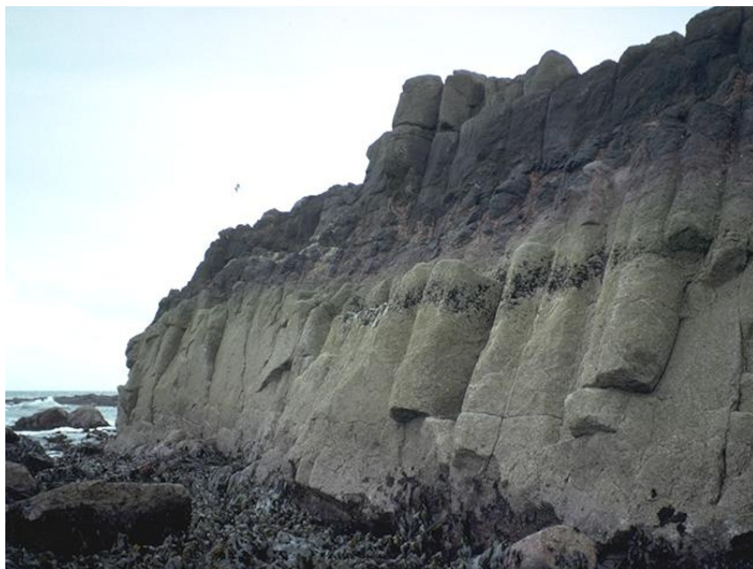
Chthamalus spp. on exposed eu littoral rock